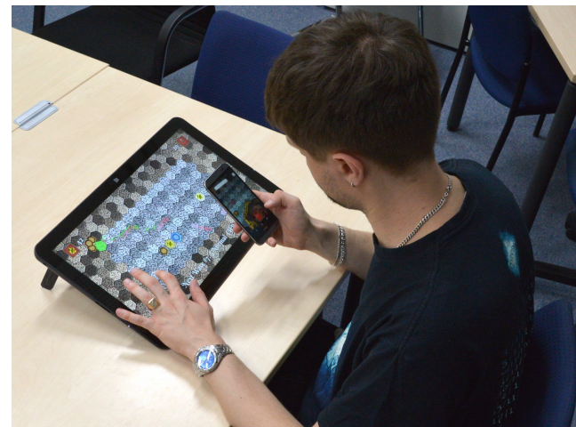
Figure 3: A user playing Towering Defense.

Animated arrows indicate the path the creeps cover, thereby the player always knows which path through the maze the creeps will take. As soon as the player builds the first wall, a timer starts and after 10 seconds the first wave of enemies spawns.