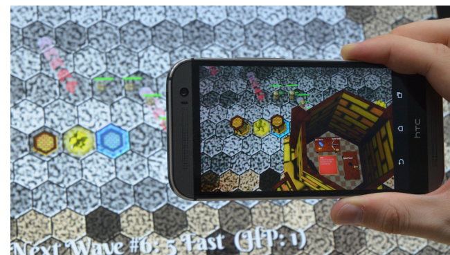
Figure 1: Towering Mode allows the player to dive into the game and explore it using Augmented Reality.

We created a new interaction technique called Towering Mode (see Fig. 1) that brings two devices together similar to the Handheld Magic Lens but with additional direct interactions on and with the lens. A gesture-based interaction and an interaction based on Augmented Reality increase the immersion by providing natural gestures and deeper perspective into the game.