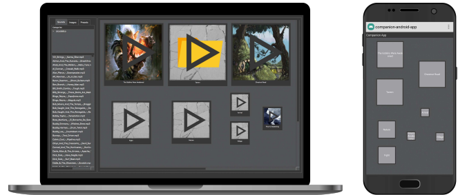
Figure 1. The left image shows Companions desktop tile canvas. The right image shows the same project layout on a smartphone.

DOI: https://doi.org/10.1145/3266037.3266097