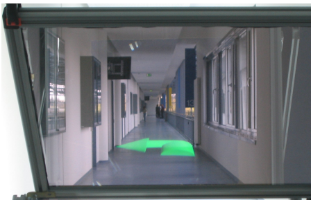
Figure 1: A Navigation Arrow superimposed in the Head-Up Display in a distance of 20 m

Navigation systems incorporating Augmented Reality (AR) address mapping issues between route guidance information and the environment. An issue of location-fixed navigation information arises through display technology. In general the resolution of such AR displays is lower than the resolution of the human eye [1]. Especially at large distances, virtual objects presented in AR displays become pixelized. Perceptibility is reduced because the scheme only consists of very few pixels.