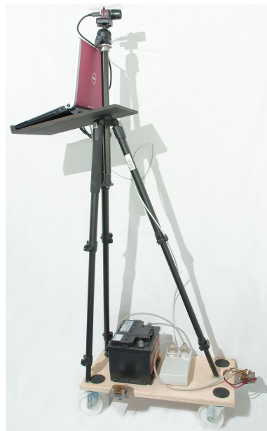
Figure 1: The carriage mounted with tripod, sensors and computing unit

As a widearea indoor tracking system Newmann et al. [5] applied an optical tracking system to have high accuracy for augmentations in combination with Ultra-Wideband (UWB) tracking and a gyroscope. The installation and calibration of such a stationary system