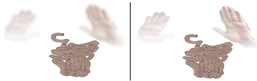
Figure 2: In the left image the hands of the user did not touch the virtual interaction plane, yet. In the upper right the zoom gesture has started.

A similar interaction metaphor can be used in touch-free interfaces by introducing a virtual interaction plane between the user and the display. Such an interface introduces several problems compared to touch-based interaction. While in touch-based interaction points on the display device are touched, in the touch-free interface the hands and the image are at different locations in space. Therefore, selecting the two points that frame the zoom area is less intuitive and the haptic feedback is missing. We propose a novel interaction method to address these problems. We are using the metaphor of frosted glass. When looking at frosted glass, objects that are far behind the glass are not seen. Objects that are closer to the glass are seen blurred and with low contrast and objects that touch the glass are seen well. When using the frosted glass metaphor for a user interface, information like text information about an organ is drawn onto the frosted glass. The hand of the user is drawn as if it would be behind the frosted glass. An illustration of this visualization is shown in figure 2. By using this interaction metaphor the hands of the user and the display are brought into the same space, such that actions like selecting a point are more intuitive. The haptic feedback of touching the surface is replaced by a visual feedback.