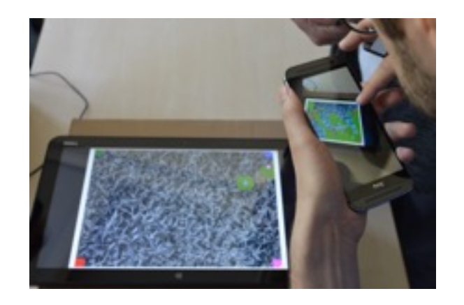
Figure 3. A player trying to move toward the upper left corner of the board using movement method 1.

3. With the camera focused on the tablet, the user can then focus the center of the camera to a particular location in the game world. The player will then move towards the location that the player is focusing on.