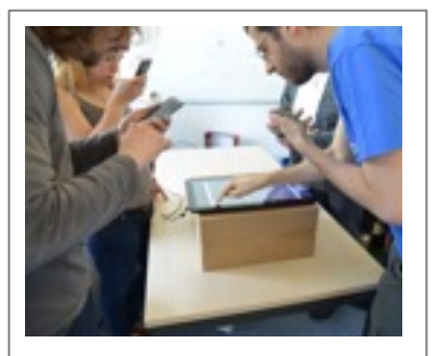
Figure 2. Players playing capture the flag on a tablet. The player in the front right is tapping on the table to steal the flag. The players on the left are moving by touching on their smartphones and are blowing into the microphones.

The game begins with each player at their own base. The players can gain the view of the playing field on their devices by pointing the smartphone's camera at the tablet. The Vuforia system can recognize the target, and the objects will appear as a 3D representation over the board. Each player can then move by touching the target location on the game world representation on his or her smartphone. The player can also blow into the microphone on his or her smartphone in order to move faster.