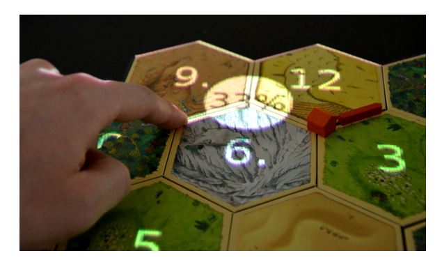
Figure 4: Augmented Settlers of Catan board game. A player checks the success chances of a potential location for a game piece.

An additional advantage of having all active components mounted to the ceiling is that the required calibration only depends on the relative position of projector and Kinect camera plus the table's height, but not on the position of the table. Consequently, unintentionally moving the table will have no negative influence on the system's operation (with the obvious exception that if the table is moved too far, part of the projection will no longer be on the table surface). On the other hand, nudging the lamp will distort the calibration noticeably while the lamp is swinging; however, our experience shows that after the lamp has come to rest, it will be sufficiently close to its original position so that no recalibration is required.