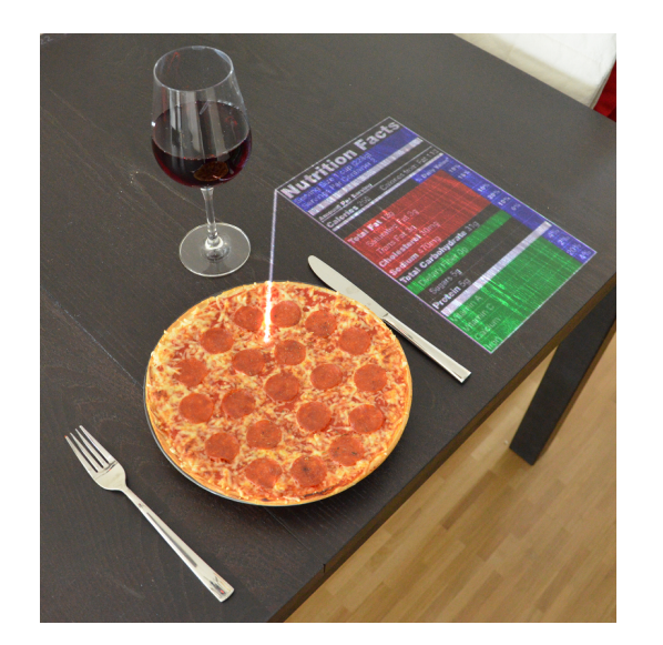
Figure 1: Augmented meal on an interactive dining table

University of Regensburg Chair for Media Informatics raphael.wimmer@ur.de