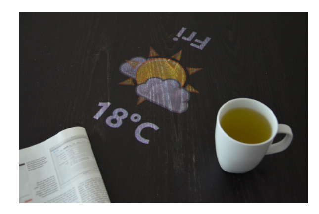
Figure 5: Ambient weather notifications

conscious attention. As an example, a possible implementation for ambient weather notifications is shown in Figure 5. The icon and text rotate slowly to enable persons at all sides of the table to easily access the displayed information without conscious effort.