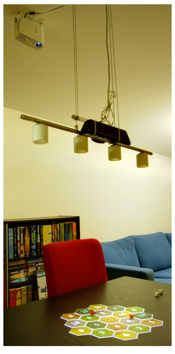
Figure 2: Interactive dining table with augmented board game, integrated into real-world living room

In this paper, we present and discuss an unobtrusive and low-cost system which is designed to address these issues. Our approach is to integrate the interactive components with the dining table in a real-world living room (see Figure 2). The system prototype is composed of a Kinect depth camera integrated into the table lamp for sensing interaction and a small LED-based projector mounted on the ceiling for displaying information on the table. The total cost of the system is approximately US$ 500 (excluding computer), placing it in the same price