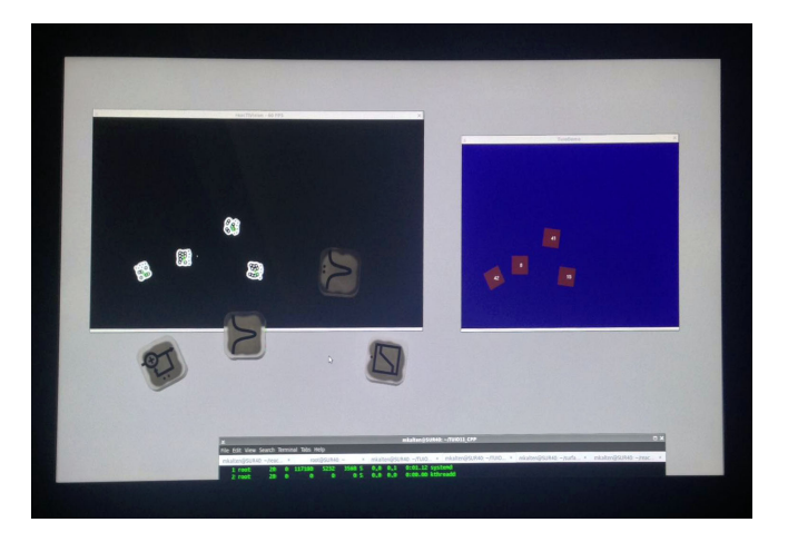
Figure 1: reacTIVision running natively under SUR40 Linux.

In this paper, we present our results from reverse engineering one of the latter systems, the SUR40 tabletop system. This was the only commercially available system with optical sensing that has directly been integrated into the display, and therefore provides an unique combination