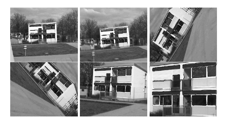
Fig. 5. Sample images from a longer sequence used in the experimental evaluation. The first image is used for generating the template of the house. Further movies can be viewed on the web site: <a href="http://campar.in.tum.de/Main/AndreasHofhauser">http://campar.in.tum.de/Main/AndreasHofhauser</a>.

To evaluate the method for augmented reality scenarios we used the proposed approach to estimate the position of a building that is imaged by a shaking hand-held camera (see Figure 5). Despite huge scale changes, motion blur and parallax effects the facade of the building is robustly detected and tracked. We think that this is a typical sequence for mobile augmented reality applications, e.g. the remote expert situation. Furthermore, due to the fast model generation, the approach is particularly useful for, e.g., mobile navigation, in which the template for the object detection must be generated instantly.