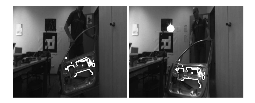
Fig. 1. An object typically encountered in assembly scenarios. A planar sub-part of a non-planar object is taken as model region and the detection results are depicted as the white contours. The different views leads to significant non-linear illumination changes and perspective distortion. The object contains only curved contours, and hence extraction of discriminative point features is a difficult task.

to compare the model template with the image content. The design of this metric determines the overall behavior and its evaluation dominates the run-time. One key contribution of the proposed metric is that we explicitly distinguish between model contours that give us point correspondences and contours that suffer from the aperture problem. This allows us to detect, e.g., an assembly part that contains only curved contours. For these kinds of objects, descriptor-based methods, that excel as they allow for perspective shape changes, notoriously fail if the image contains not enough or only a small set of repetitive texture like in Figure 1.