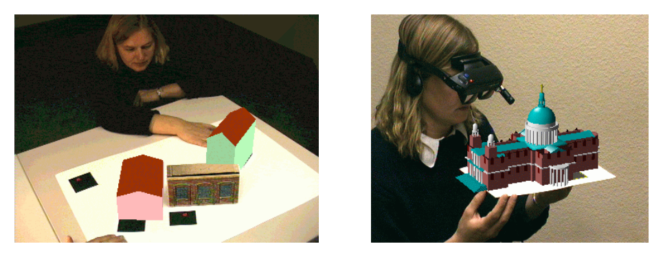
Fig. 1. a) Manipulation of virtual and real objects. b) Manipulation of a model of St. Paul's Cathedral via a piece of card board. (Reprint of Fig. 10b in [10]).

Our first demonstration shows a toy house and two virtual buildings. Each virtual house is represented by a special marker in the scene, a black square with an identification label. By moving markers, users can control the position and orientation of individual virtual objects. A similar marker is attached to the toy house. The system can thus track the location of real objects as well. Figure 1a shows an interactively created arrangement of real and virtual houses. Figure 1b shows a VRML-model of St. Paul's Cathedral being manipulated in similar fashion via a piece of cardboard with two markers.