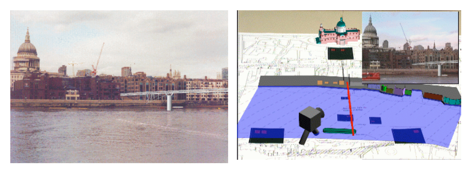
Fig. 2. a) Proposed millennium footbridge across the river Thames. b) An augmented map of London including a movie loop with an AR video clip.

Using a map of London, a simple model of the houses along the river shore, and a CAD model of the proposed bridge and St. Paul's cathedral, we have generated a 3D presentation space on a conventional table which pulls all information together, giving viewers the ability to move about to inspect the scene from all sides while interactively moving the bridge (Figure 2b) and choosing between different bridge styles. A hand wave across a 3D camera icon provides access to another information presentation tool: a movie loop with a pre-recorded augmented video clip showing the virtual bridge embedded in the real scene.<sup>1</sup>