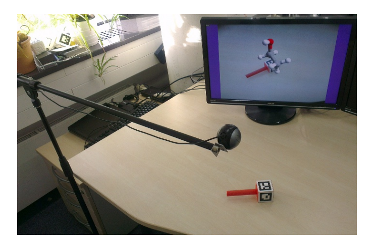
Fig. 3. Computer setup for the Augmented Chemical Reactions application, using a webcam a physical cube on a handle and a monitor. The keyboard that is required to cycle through a set of molecules is not shown.

tracking algorithm similar to the AR-toolkit [5], [6] to detect and recognize the currently visible patterns on the cube.