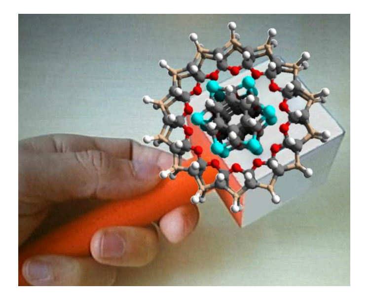
Fig. 2. Augmentation of a molecule on top of the marker cube.