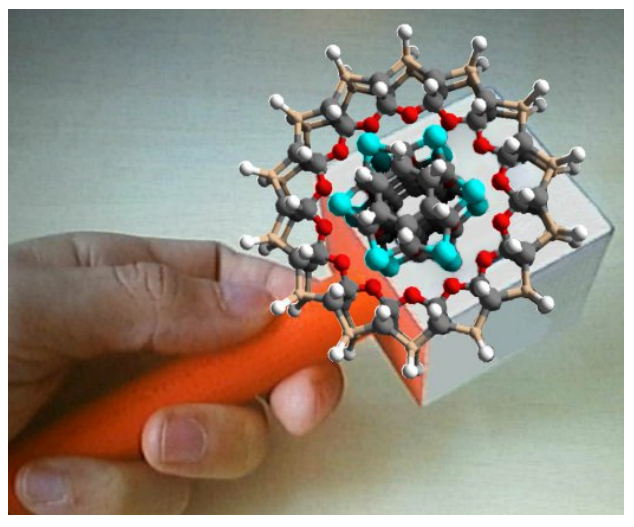
Figure 1. A hand held device is tracked by the Augmented Chemical Reactions application and visualizes a virtual molecule on top of it.

There already exist several applications which visualize molecules in a 3dimensional manner. But those applications mostly have a difficult user interface especially when it comes to the manipulation of the rotation and positioning of the molecules while inspecting the molecules. They make use of the keyboard and the mouse to position and rotate the virtual molecules. As the movement of a computer mouse is restricted to two dimensions it has to be mapped to the 3-dimensional rotation and the 3-dimensional placement of the virtual molecules. As this is