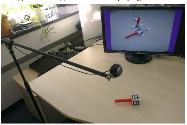
Figure 2. Computer setup for the Augmented Chemical Reactions application, using a webcam a physical cube on a handle and a monitor.

To be as flexible as possible, the application can associate any molecule that is stored in a Protein Database file (*.pdb) with the physical markers (Figure 4). Even more, the application supports various displaying methods as