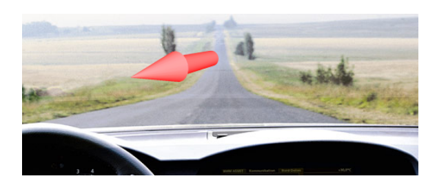
Figure 2. 3D arrow in front of the car pointing towards the position of imminent danger

The second visualization scheme presents a 3D arrow (figure 2). Its back end is placed about 3 meters in front of the driver in height of a typical driver's head. The front end points in the direction of the imminent danger.