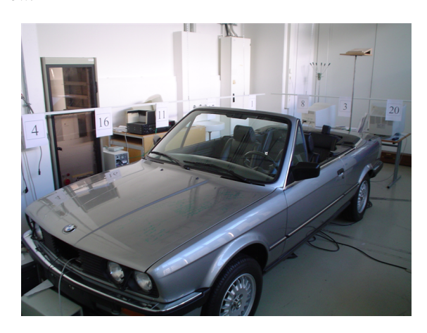
Figure 3. Driving simulator, surrounded by numbered sheets at eye level

during the simulation. Simulated traffic scenes are shown on a planar screen at a focal distance of 3 meters in front of the car driver. The HUD-based visualizations are shown by a second appropriately calibrated projector on the same screen <sup>1</sup>. The simulation covers a 50-degree visual field of view.