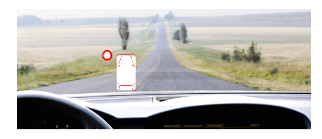
Figure 1. Bird's eye view showing the position of imminent danger relative to the car

The first scheme presents a two-dimensional bird's eye exocentric view of the car at a fixed position in front of the windshield (figure 1). The point of danger is indicated by an octagon. Several symbols were preevaluated. An octagon provides the best perception.