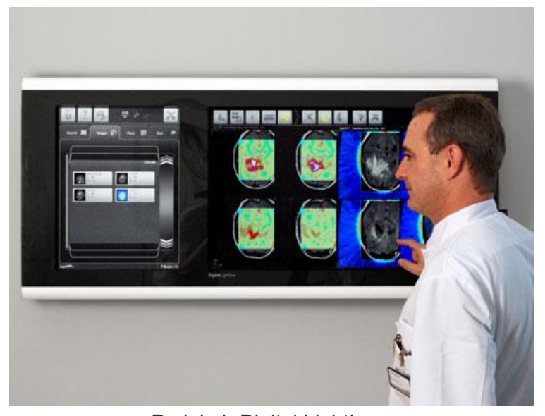
BrainLab Digital Lightbox