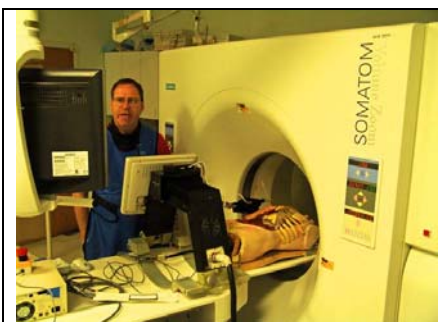
Figure 1: Needle driver robot for lung biopsy using phantom and joystick control

Finally, I will also present our recent work in respiratory motion compensation including developing a motion simulator platform for the CyberKnife radiosurgery system as shown in Figure 3.