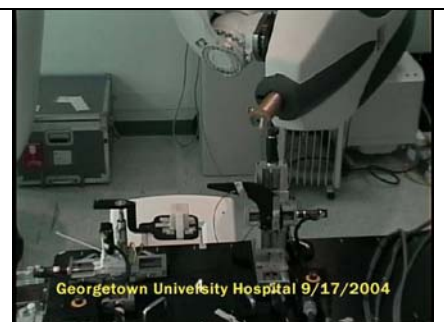
Figure 3: CyberKnife motion platform for respiratory motion compensation